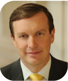
SEN. CHRIS MURPHY